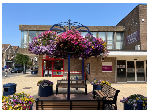
Large Town, Portishead GOLD