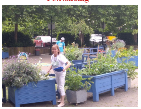
Calne, Community Pocket Park Outstanding