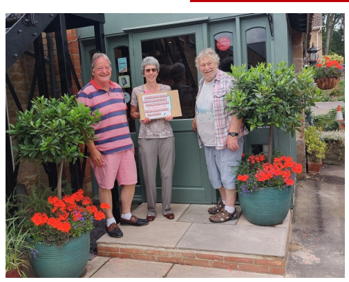
Village & Small Town Haselbury Plucknett