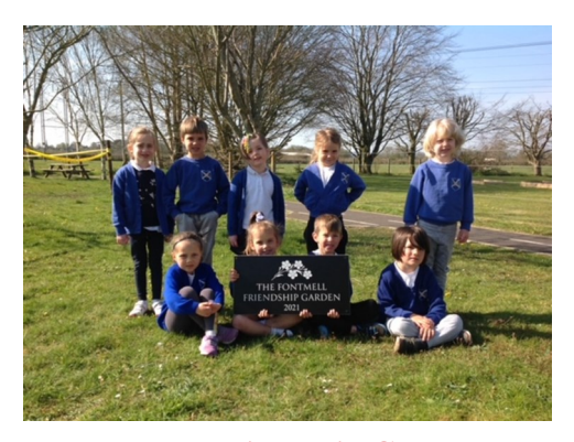
Fontmell Friendship Garden Shaftsbury, Outstanding