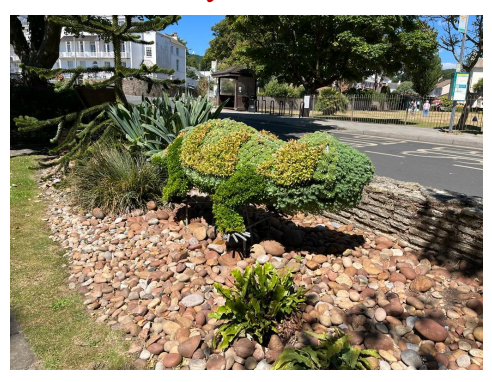
Best Seaside entry. Winner Sidmouth.