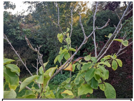
Magnolia showing 'false' Autumn, where tips have lost foliage

As I pen this article, overnight temperatures are still around 15C, in the middle of November, highlighting that 2022 will be a year where the weather has been a constant source of fascination, heartbreak and a sign of change. We are all aware of the ongoing and future consequences of our species' impact on the world's climate, and, with political will, the world's nations will band together to figure how we soften the ongoing problems that we must now confront. We do, however, have to face that the summer we've just experienced may become the norm, bookended by periods of thunderous rainfall and heavy storms like those we faced in March, and as gardeners we aren't immune to it all. So, what has this summer showed us about our gardens and natural environment.