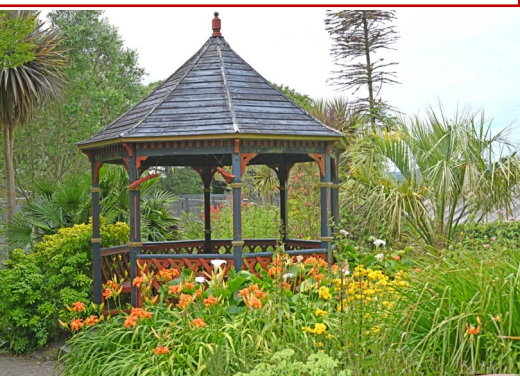
Preece Cup Hayle in Bloom