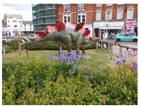
Sponsors Trophy, Best entry Winner Exmouth .