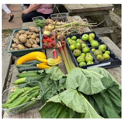
BLAG Truro Outstanding