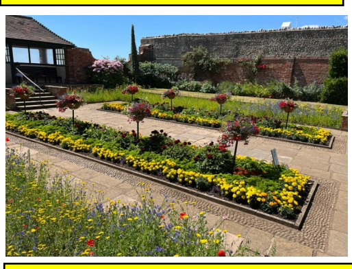
Seaside Sidmouth GOLD