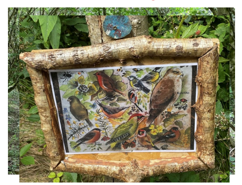
Coosebean Woodlands, Truro Outstanding