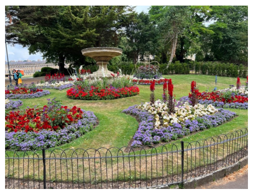
Small City, Bath SILVER GILT