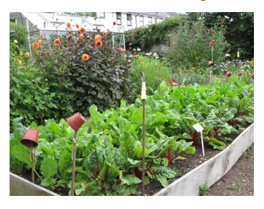
Kingsbridge Community Garden Outstanding