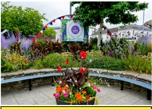
Horticultural Trophy Kingsbridge in Bloom