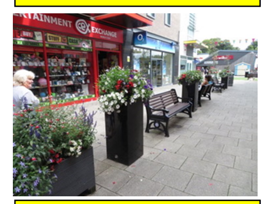
Bid St Austell GOLD