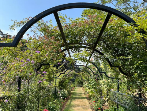
Tessier Gardens, Babbacombe