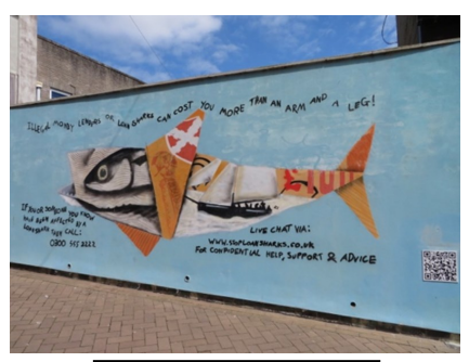
Runner Up St Austell