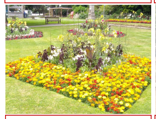
Portman Cup Truro in Bloom