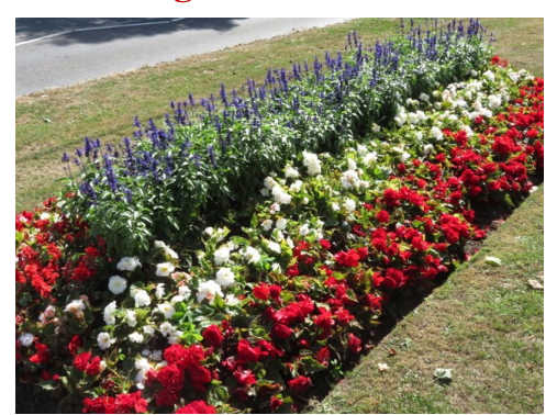
Poltair Park, St Austell