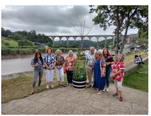
Viv Verrier Trophy, Best new entry Calstock