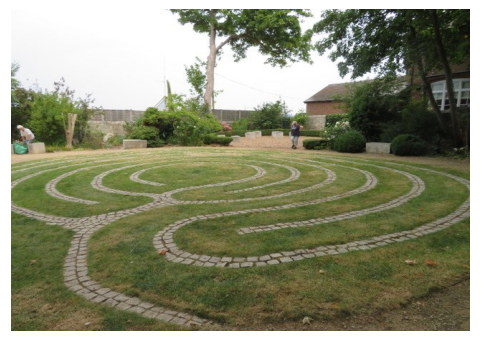
Peace Garden, Weymouth Thriving