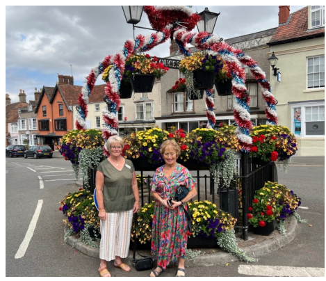
Large Town, Thornbury