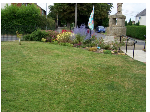
Severalls Community Garden, Crewkerne. Outstanding