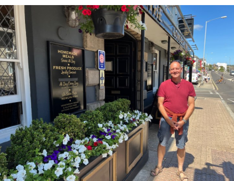
Longboat Inn, Penzance GOLD