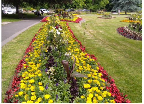
Boscawen Park, Truro