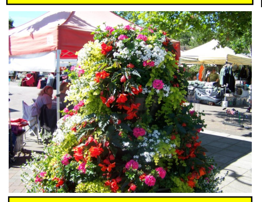
Small Town, Kingsbridge GOLD