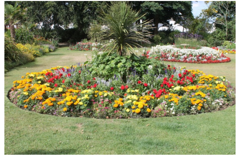
Friends of Royal United Hospital, Bath Outstanding