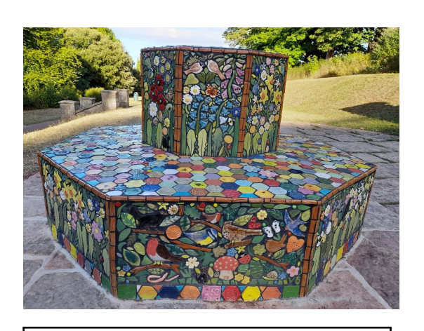
WINNER Homeyard Botanical Gardens Sheldon