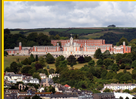
Britannia Royal Naval College