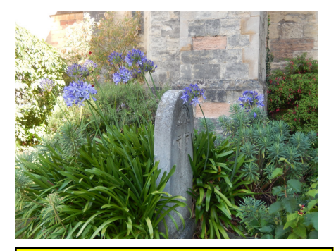
Town Newquay, Gold, Group Winner

Newquay. A late selection in this years competition resulted in a Gold award and Category winner. What a transformation you have achieved over the years. The judges cited horticultural quality and teamwork as being key to your excellence.