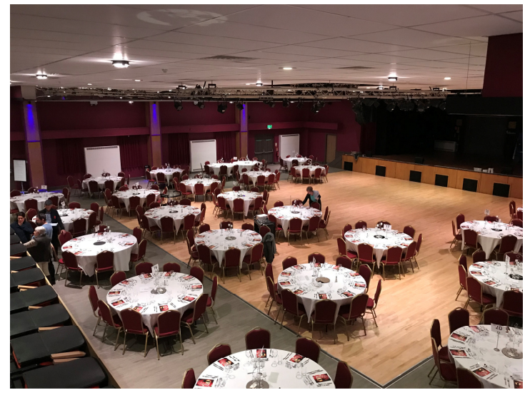
Westland Leisure Complex, Yeovil

It is a newly renovated centre and will provide an excellent location for the event. More details will be in the Spring Newsletter.