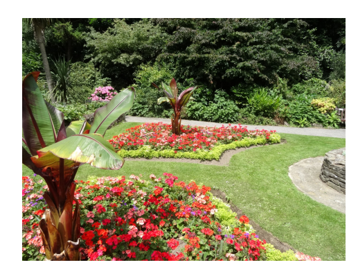
Seaside Sidmouth Gold, Group Winner

Clifton Our Urban Category winner of a Silver Gilt Medal. Outstanding IYNs, horticultural features and the Fabulous Bristol Zoo made this a very good entry well done.