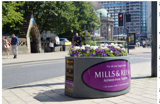
Amberol self watering planter

The 30 page booklet has been produced by Amberol, who manufacture selfwatering planters and street furniture such litter bins, benches and picnic tables,