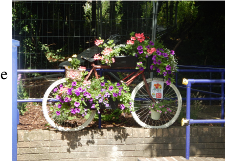
Keynsham Railway Station 2017

Royal Horticultural Society <a href="mailto:rhs.org.uk/communities">rhs.org.uk/communities</a>