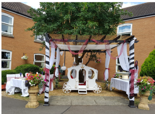
Brookside Care Home Melksham GOLD

These nine guiding principles all combine to create a place with a range of healthy lifestyle opportunities, characterful designs and a legacy of which to be proud. Tadpole Garden Village will be the perfect embodiment of this timeless way of living.