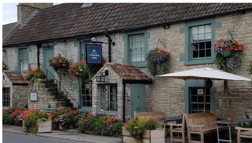
The Crown Inn, Kelston GOLD

Entries were up on those of 2017 in the Leisure, Tourism & Business awards. The awards were presented at the awards ceremony at the Westland Leisure centre Yeovil on 4th October 2018. Entries again came from all over the region and really pulled out the stops to again raise the quality of premises and visitor experience. The entry fee is again £20 per entry to help cover assessment and feedback costs. This environmental benchmarking award has much to commend itself for as a measure of quality.