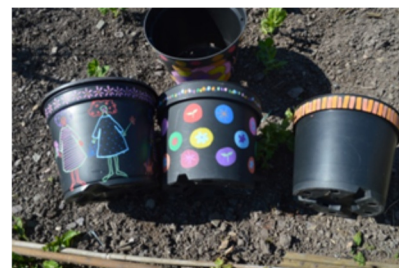
Illustration of the difference gardening has made to these people, e.g. participation in a group, improved communication skills, social inclusion, progress in life skills, community participation, links with local authority or other voluntary groups, progress towards work and any obvious health benefits especially time spent outside.