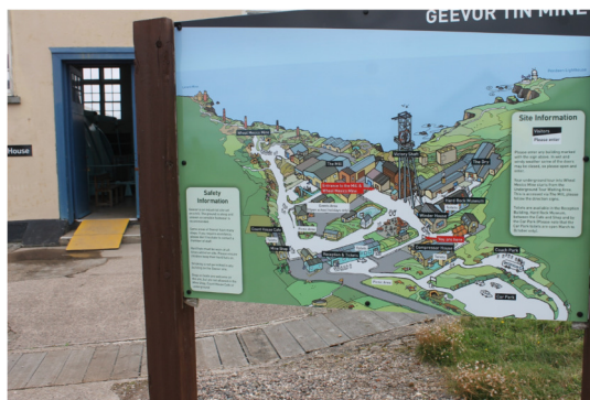
Pendeen Geevor Tin Mine GOLD