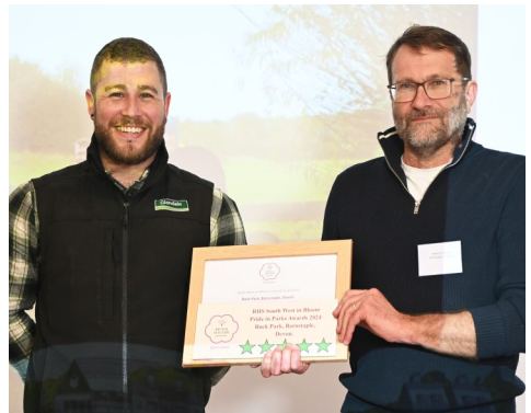
Rock Park, Barnstaple 5 Stars

Our thanks go to Nigel Bloxham for taking the photos at our Spring Seminar. Photos of the Parks Presentation are available to view and order on Nigel's website: http://www.ukphotogallery.com