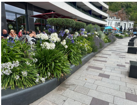
City/Small City: TORQUAY

There is no doubt that they will all do an excellent job representing our region. Blooming Big Good Luck Wishes to you all!