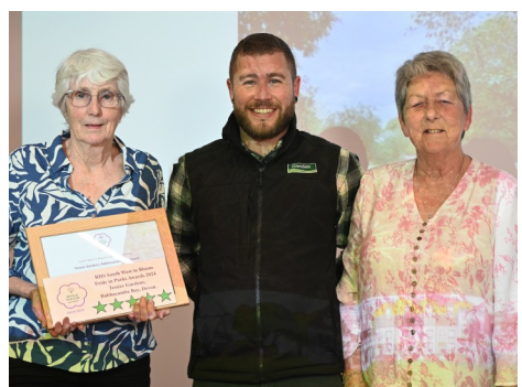
Tessier Gardens, Babbacombe Bay 5 Stars