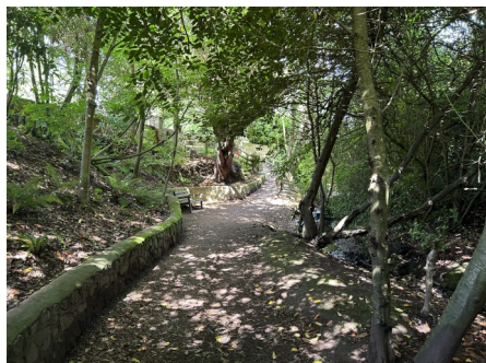
Glen Goyle Park, Sidmouth

Entry forms are available to download at southwestinbloom.org.uk or by emailing: southwestinbloom1@outlook.com