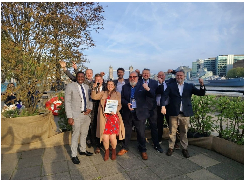
Some of the Glendale team at the Awards Ceremony

Our sponsor Glendale offers horticulture expertise including, grounds maintenance and tree surgery, landscaping & fencing and countryside contracting services.