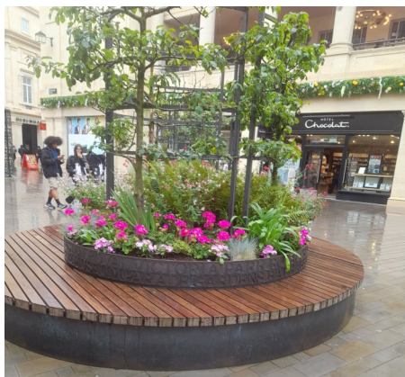
BIDS: Bath BID