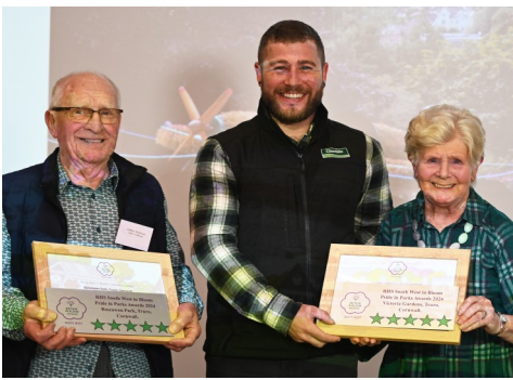
Victoria Gardens Truro 5 Stars