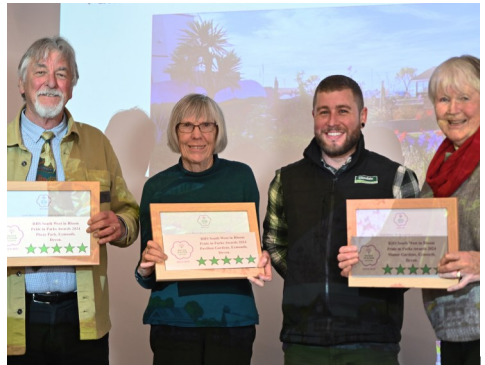
Pavilion Gardens, Phear Park, Manor Gardens all in Exmouth - 5 Stars