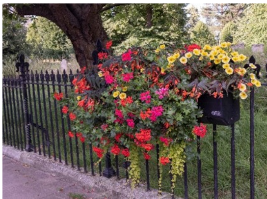
Full Barrier Basket

View Amberol's sustainable self-watering planters that save time, water and money.