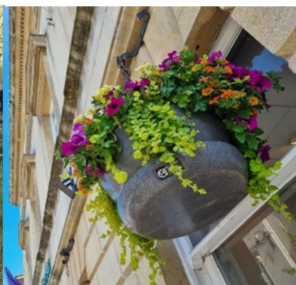
Cup & Saucer Hanging Basket