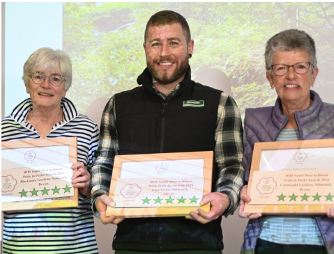
Glen Goyle, Connaught Gardens & Blackmore Gardens all in Sidmouth - 5 Stars