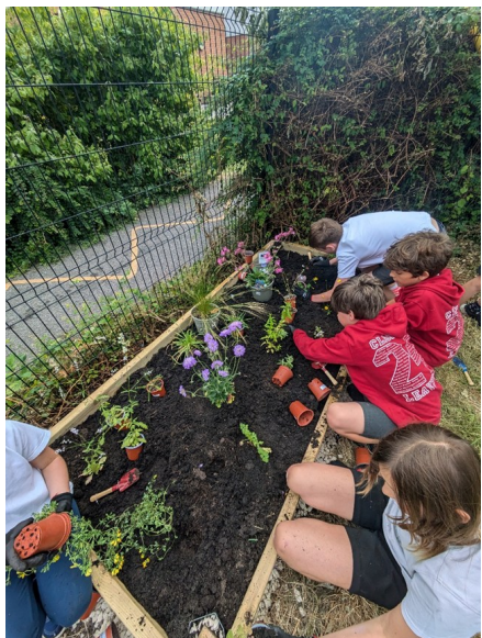
Wild Space designed by pupils and teachers in Bristol

Every transformation will help make space for butterflies and moths and provide a haven for people to slow down and connect to nature. Wild Spaces should help butterflies and moths complete their lifecycles, enabling them to feed, breed and shelter; be free from pesticides; and where compost is used it should be peat free.