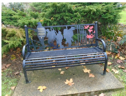
Rock Park, Barnstaple