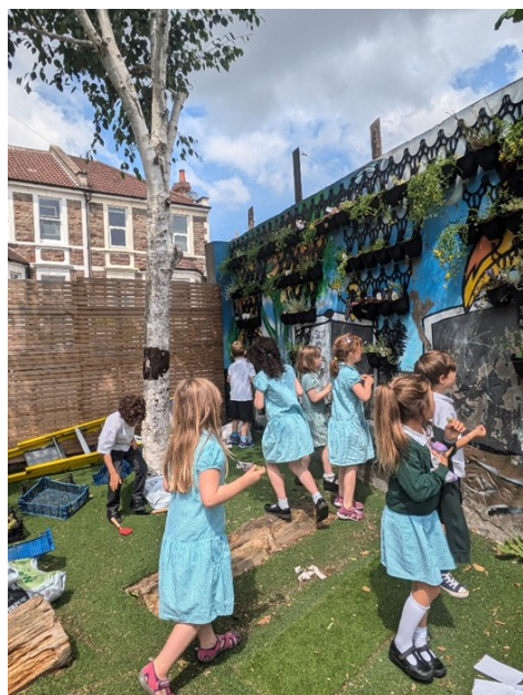
Creation of a living wall as part of the Bristol Wild Spaces project

Wild Spaces are all around us. They are the flowers in our window boxes, the pots on our patios, the patches of wildflowers in our gardens or allotments, and the wildflower meadows in our churchyards and parks. They provide space for nature to thrive, and places for people to access and enjoy.