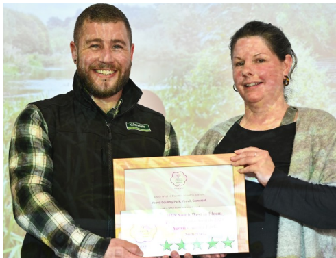
Yeovil Country Park 5 Stars