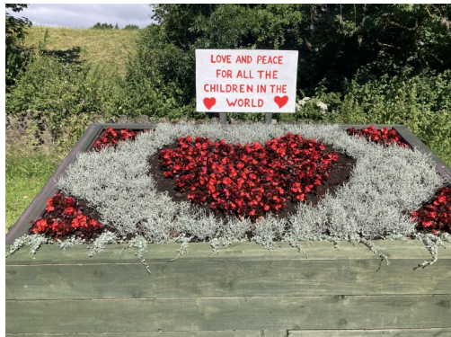
Large Town: THORNBURY